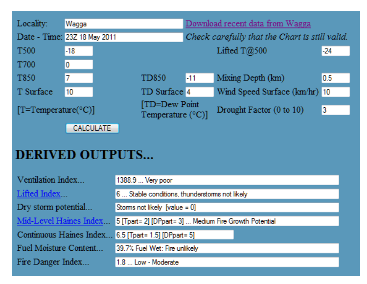
Figure 1. Analysis of an Aerological Diagram.